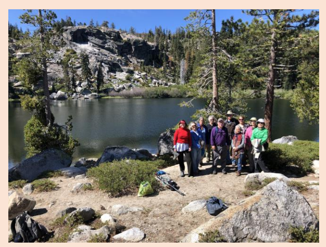
Group hike to Flora Lake. At least two folks went swimming!

indignation. Michael said, "Don't give up," noting that it is OK to feel sad and hopeless sometimes, but there are always a few people finding a few more people and not giving up!