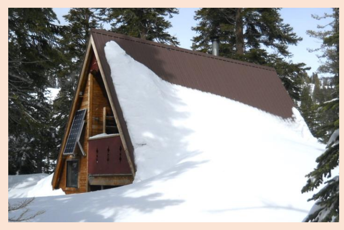
Bradley Hut, March 2019, with snow up to the second-floor balcony.