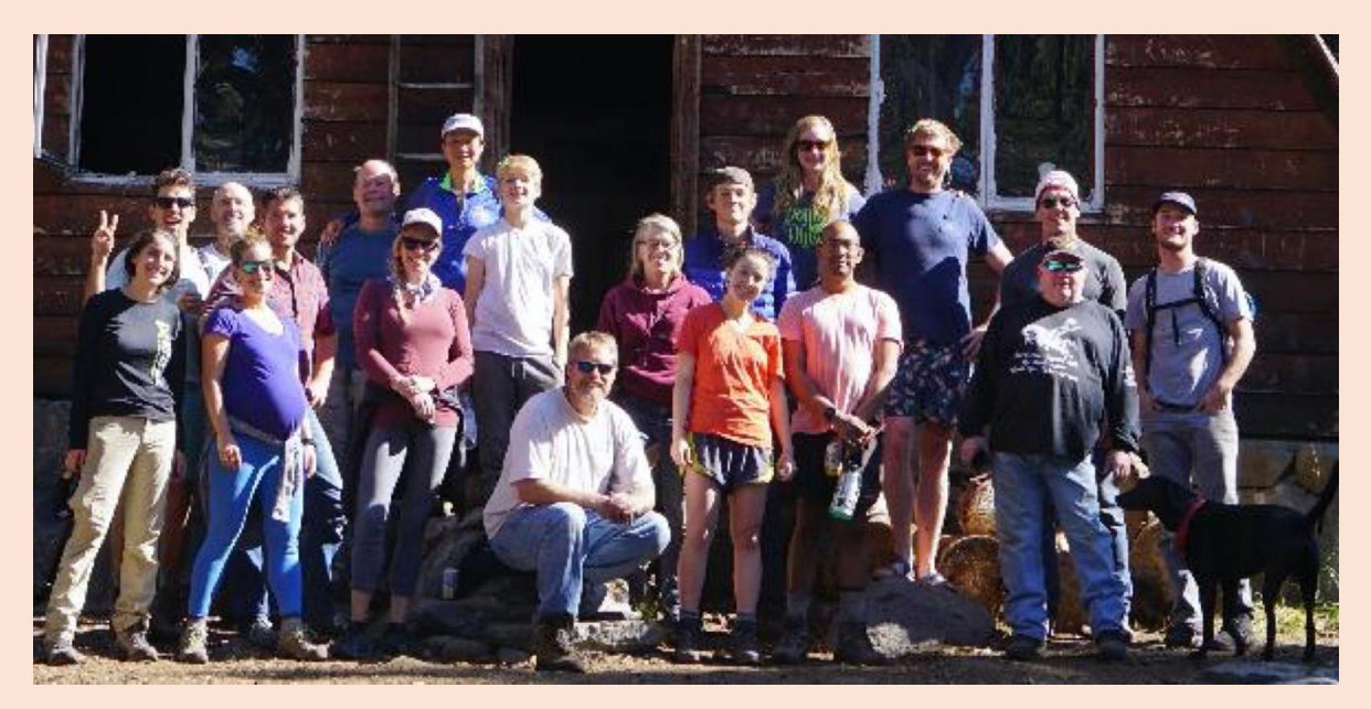
October Ludlow Hut work party (photo by Ryan Corley).