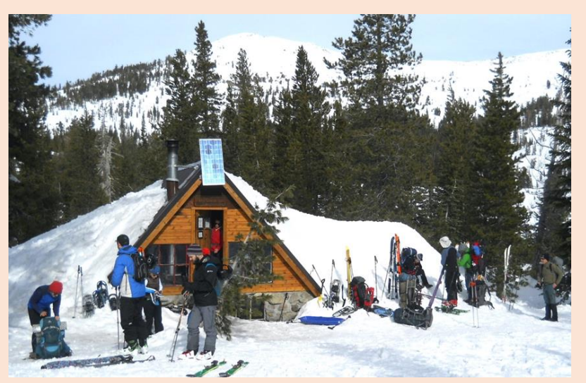
One party arrives as another departs, Peter Grubb Hut, late January 2019

For more information on reservations, availability, etc., contact the Hut Reservations Coordinator at Clair Tappaan Lodge, P.O. Box 36, Norden, CA 95724 Phone: 1-530-426-3632 Email: reservations@clairtappaanlodge.com