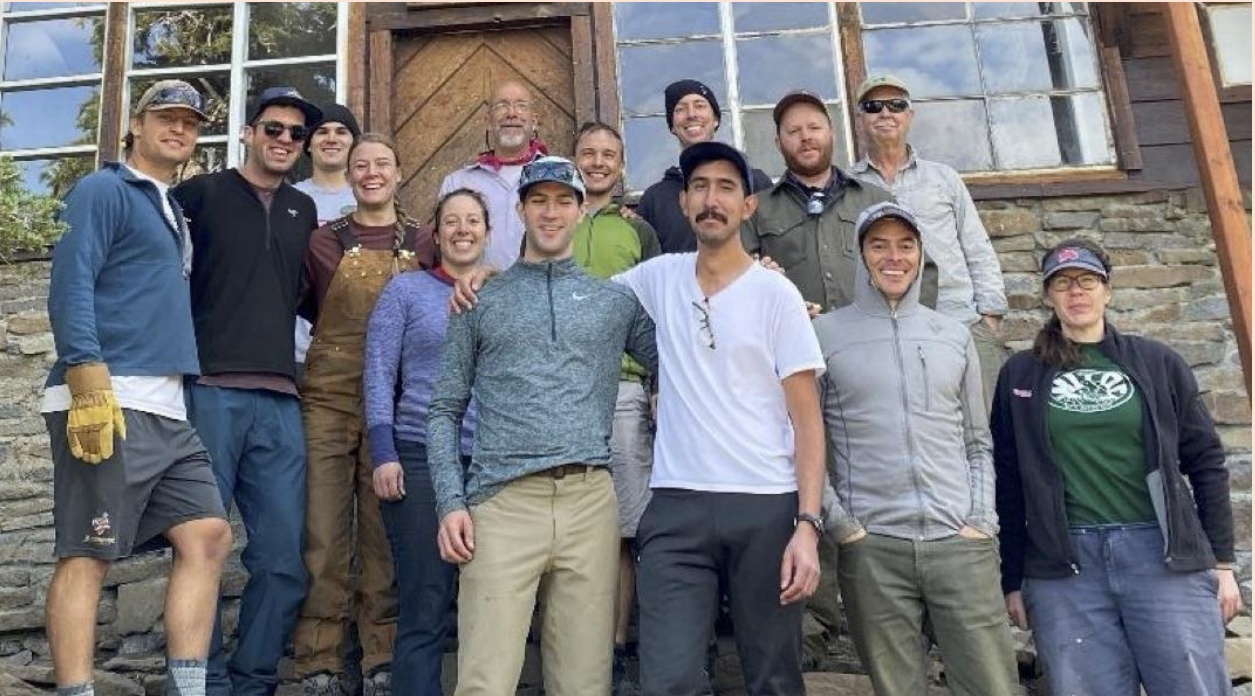
October Benson Hut work party.