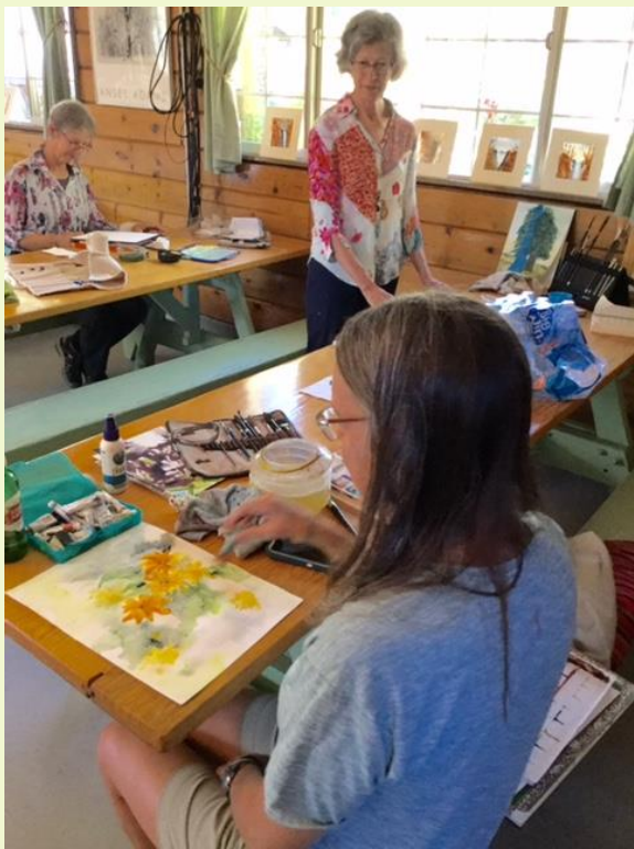
Meadow wild flowers, the sheep herders' cabin at Van Norden, Lake Flora, Maiden's