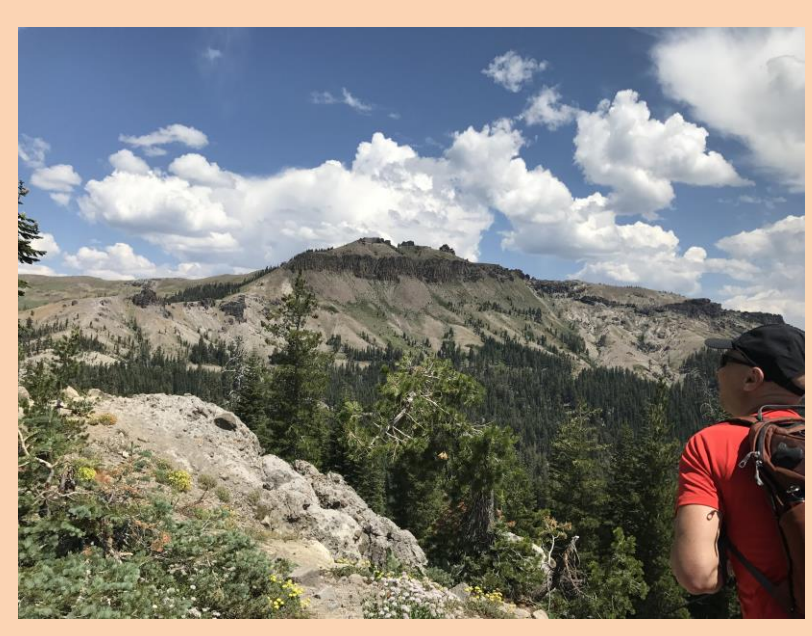
And the views