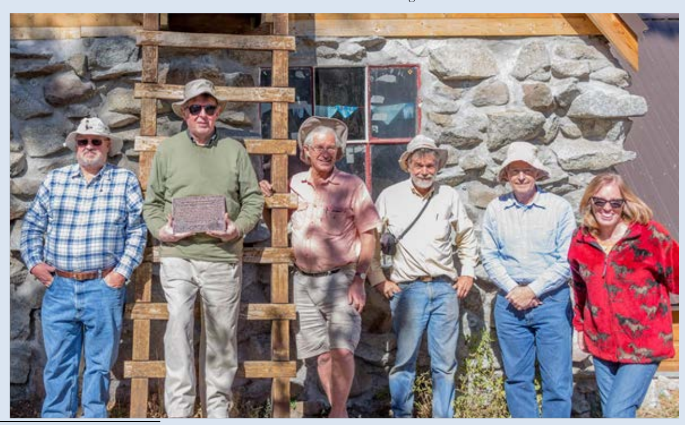
<sup>1</sup> Benson Hut is also a memorial, but its origins are less clear. When sorted out, a Benson history may become the subject of a future Goshawk article.

It took a year for the principals to agree on a procedure and dates, but everything was eventually aligned with a regular Grubb Hut work party scheduled for October 7-8. Five members of the family and two friends joined in the work party, along with 14 other volunteers. Among other tasks, the work party brought firewood to the hut from a remote cutting site, cleaned the wood stove and its stovepipe, and boxed shingles from an old roof that can be used as kindling.