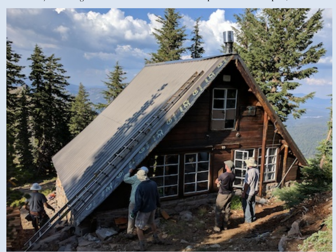
South side of Benson Hut after barge rafter demolition.