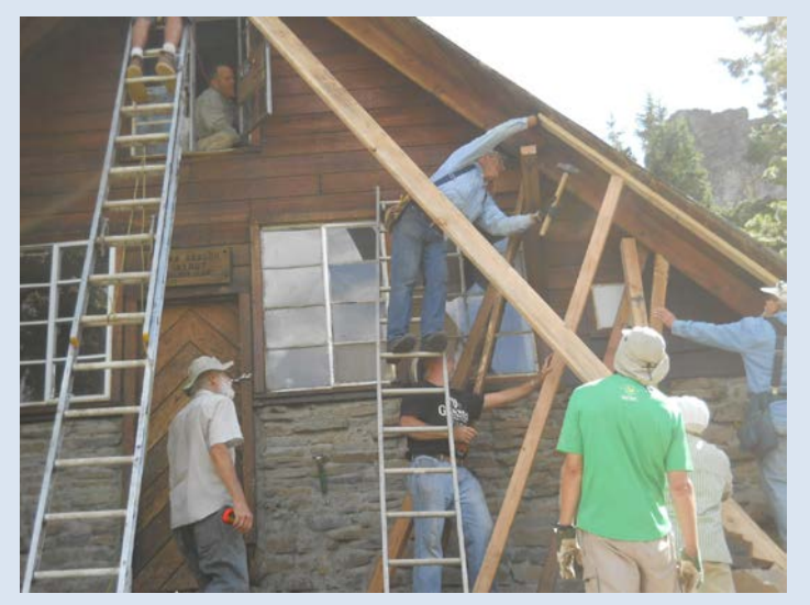
Repair Team wrestles with north side barge rafter and supports.

Vertical roof supports were installed under the barge rafters Tuesday morning, and the crew headed out with a wary eye toward new clouds moving parallel to the Crest and dumping rain into the North Fork watershed to the west.