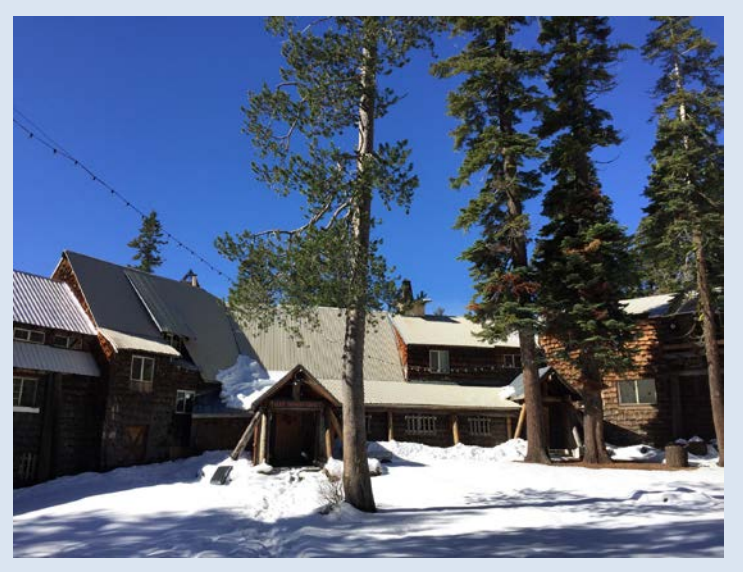
Clair Tappaan Lodge, November 2017

With an anonymous donor willing to match $10,000, we reached our goal and contributed $20,000 to the Clair Tappaan Lodge Environmental Education Scholarship Fund. The Fund subsidizes underserved students and Sierra Club's Inspiring Connections Outdoors program (<a href="https://content.sierraclub.org/outings/ico">https://content.sierraclub.org/outings/ico</a>) to help kids experience the High Sierra while participating in high-level environmental education and conservation programs and group activities in a comfortable environment.