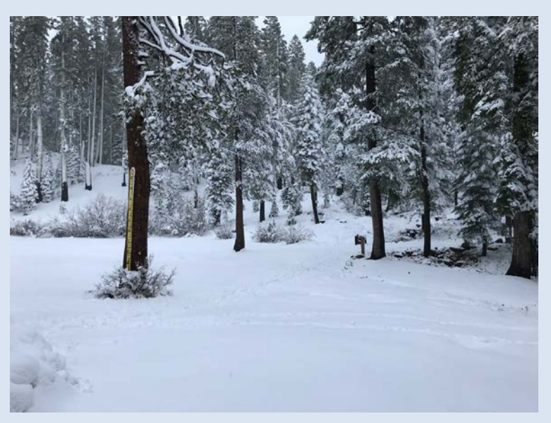
It's snowing on Donner Summit!