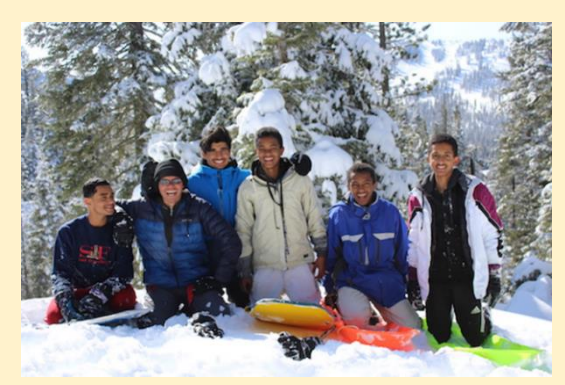
Soccer Without Borders at CTL, Winter 2019