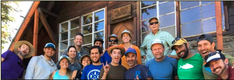
September work party at Benson Hut