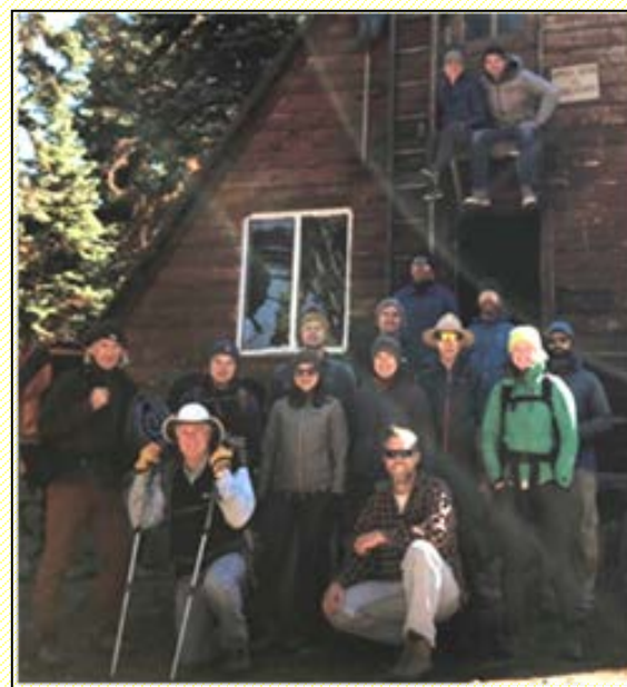
Ludlow work party in October