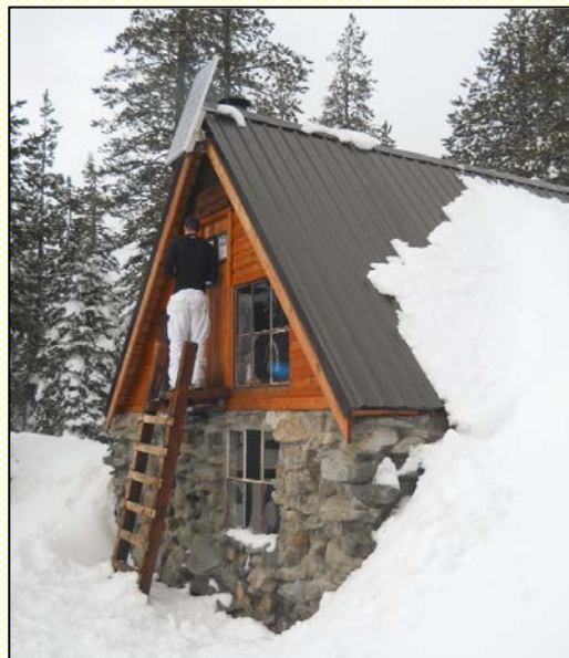
Peter Grubb Hut in January 2018

It was another successful year for hut use and maintenance. The huts remain an attractive choice for people interested in rustic shelter at a reasonable price. Hut users then reciprocate by providing the majority of labor for hut maintenance and preparation for the next winter season. The 2017-18 season was not an especially good one for winter sports in the Donner Summit and Lake Tahoe region. There was little snow for Christmas and New Year; then commercial ski resorts suffered through the next two holiday weekends. However, about three inches of snow fell between Sunday night and Monday morning of President's Day weekend. That was the beginning of a month of subfreezing temperatures and better snowfall. Total precipitation for the winter was still well below average, and snow was melting quickly by the middle of April, but the month of good winter conditions starting in mid-February made a difference.