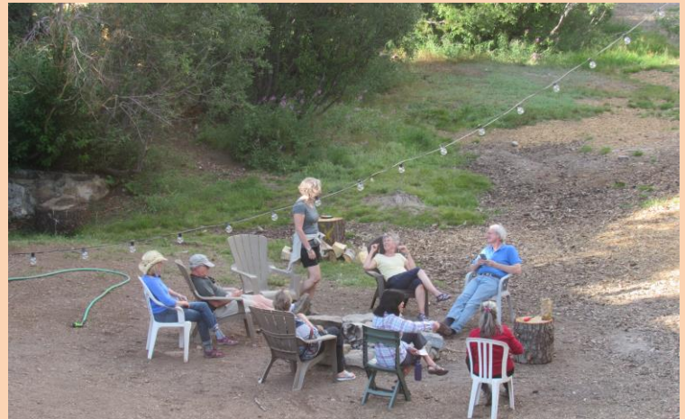
Front yard gathering