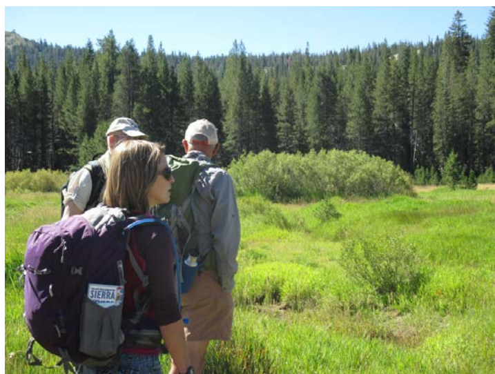
Hiking in Van Orden Meadow.