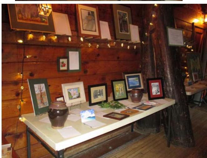
Art Auction